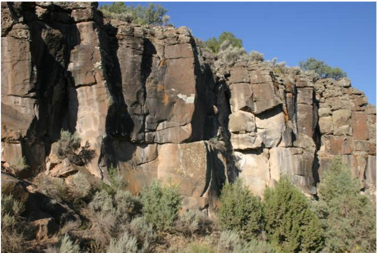
These rock faces and variations of them are in abundance. These formations lead to and are part of the Rio Grande Gorge.