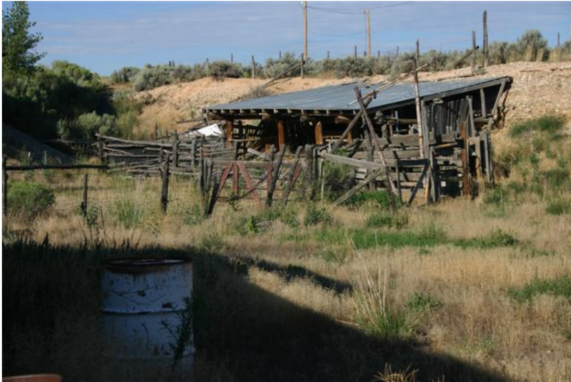
Old ranch and farm subject matter abounds in Taos.