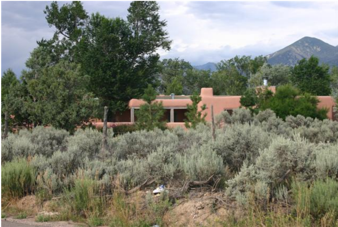
The warm adobe colors of the buildings stand out beautifully from the surrounding desert colors.