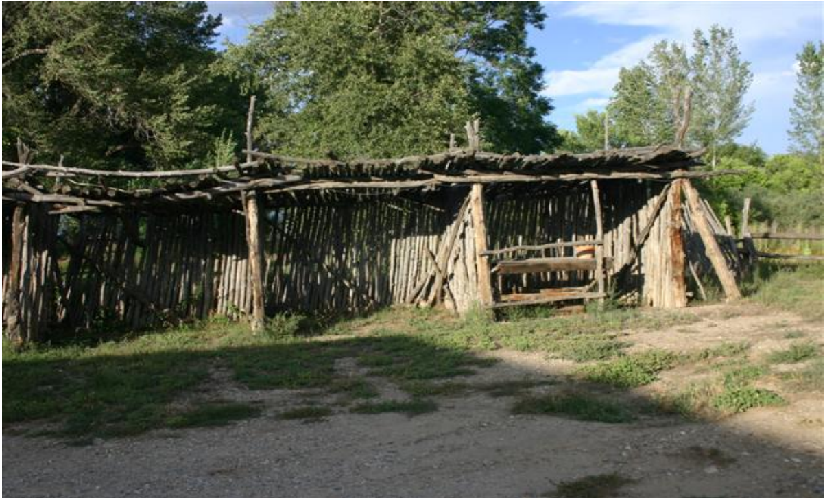
This photo was taken at La Hacienda de Los Martinez. La Hacienda de Los Martinez is a ranch museum of yesteryear. It is one of our subjects. We will paint there.