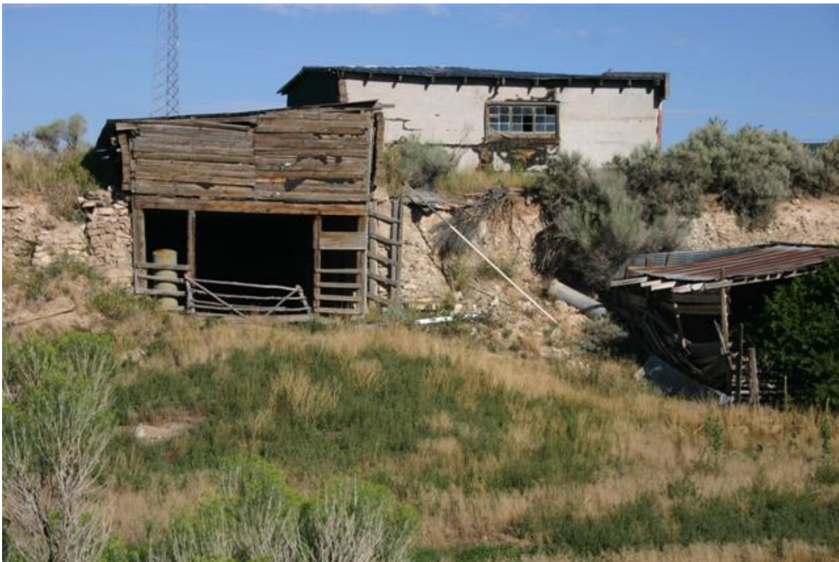
This detail photo of an old ranch is one of the morning's subject matter. Turn around from this old ranch and you have a beautiful view of the Taos Valley leading into the distant mountains.