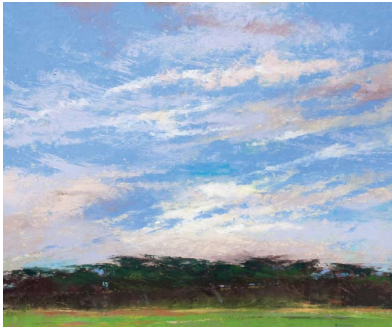
Monterey Sky (14x15)