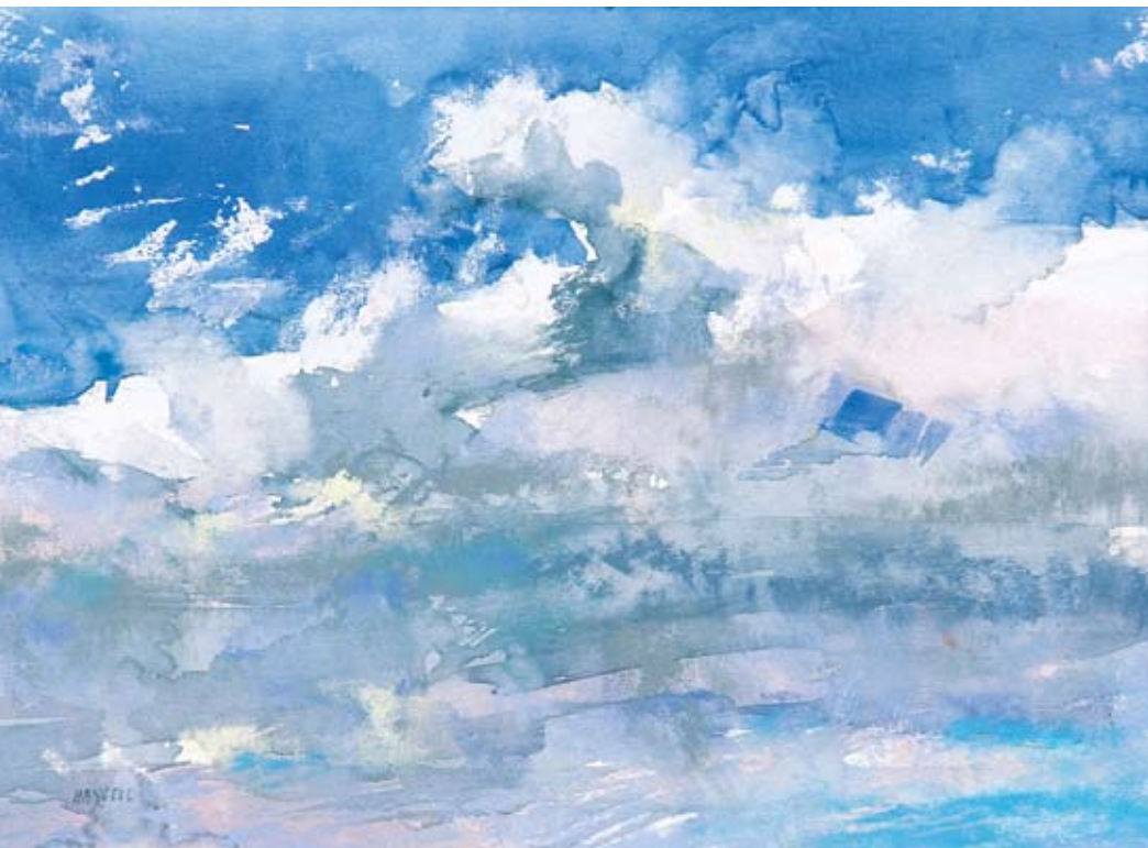
Drifting Clouds (10x14)