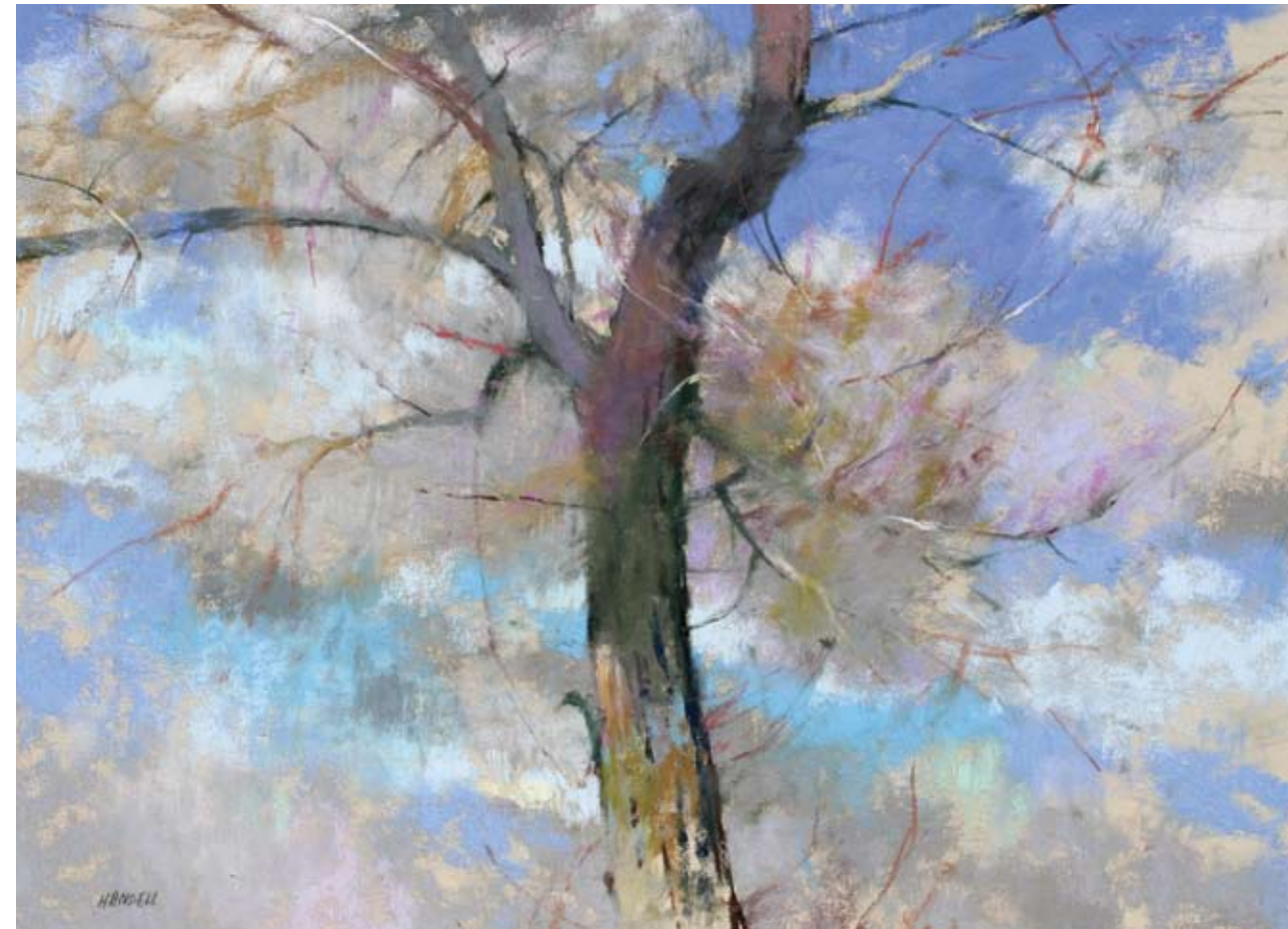
A Blustery Moment (11x15)